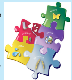
Logo Climate Impact Guide

the exchange of data between sectors, the differences in use of data and the consequences of these per sector.